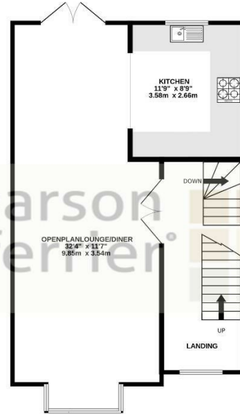
1ST FLOOR 495 sq.ft. (46.0 sq.m.) approx.